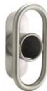
Wall and Ellipse Hose Bracket