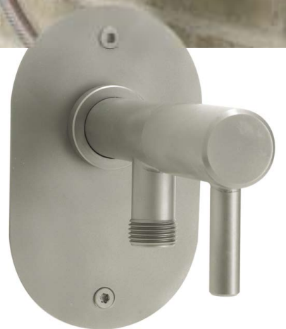
WALL WATER TAP